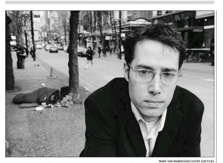
Dr. Evan Wood, founder of the Centre for Science in Drug Policy, says it is time to stop treating drug use as a criminal problem when it can be dealt with more effectively as a health issue.

The Vienna Declaration has received extensive media coverage. More than 200 articles have been written about the Declaration by media outlets around the world, including leading newspapers such as the New York Times , the Guardian , El Pais, the Globe and Mail, the LA Times, and the Wall Street Journal.