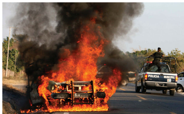
Police officers drive past a burning police vehicle in the Pacific resort town of Zihuatanejo, Mexico, on February 25, 2009. Earlier, gunmen opened fire and hurled grenades at the patrol car, killing four officers.

“The criminalisation of drug users is fuelling the HIV epidemic and has resulted in overwhelmingly negative health and social consequences. A full policy reorientation is needed.” - Vienna Declaration